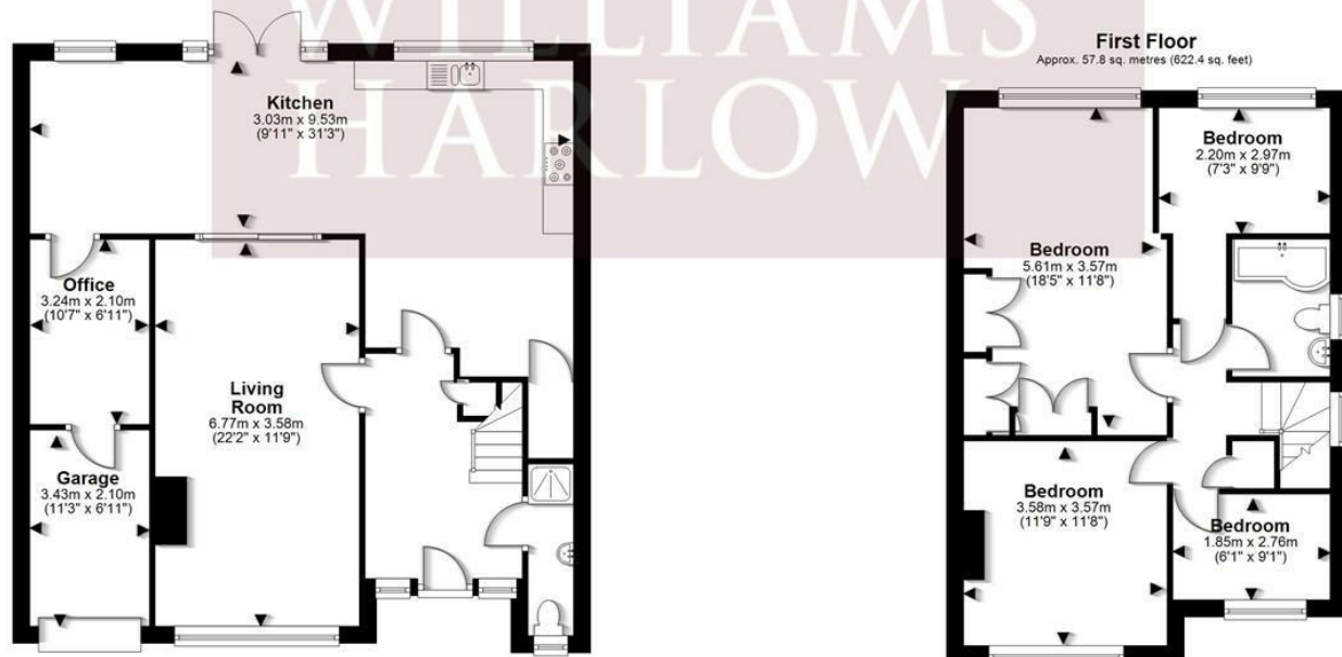
Main area: Approx. 183.8 sq. metres (1978.0 sq. feet) Plus garages, approx. 7.2 sq. metres (77.4 sq. feet)